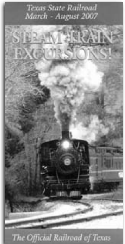
The Texas State Railroad's new brochure is "hot off the press," but the date on the cover only lists the operating schedule through August 2007.

He said his group will work to defeat the bills.