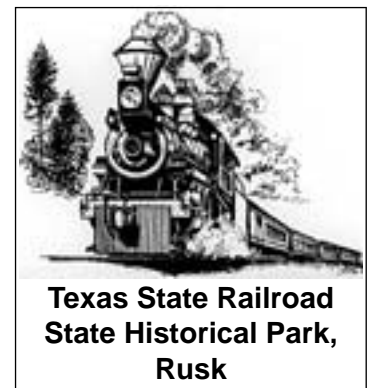
Texas State Railroad State Historical Park, Rusk