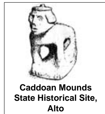
Caddoan Mounds State Historical Site, Alto